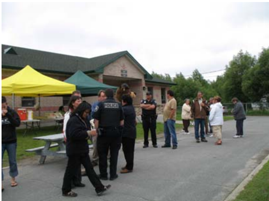
There were about 55 people who came out to support the program for the launching and BBQ.